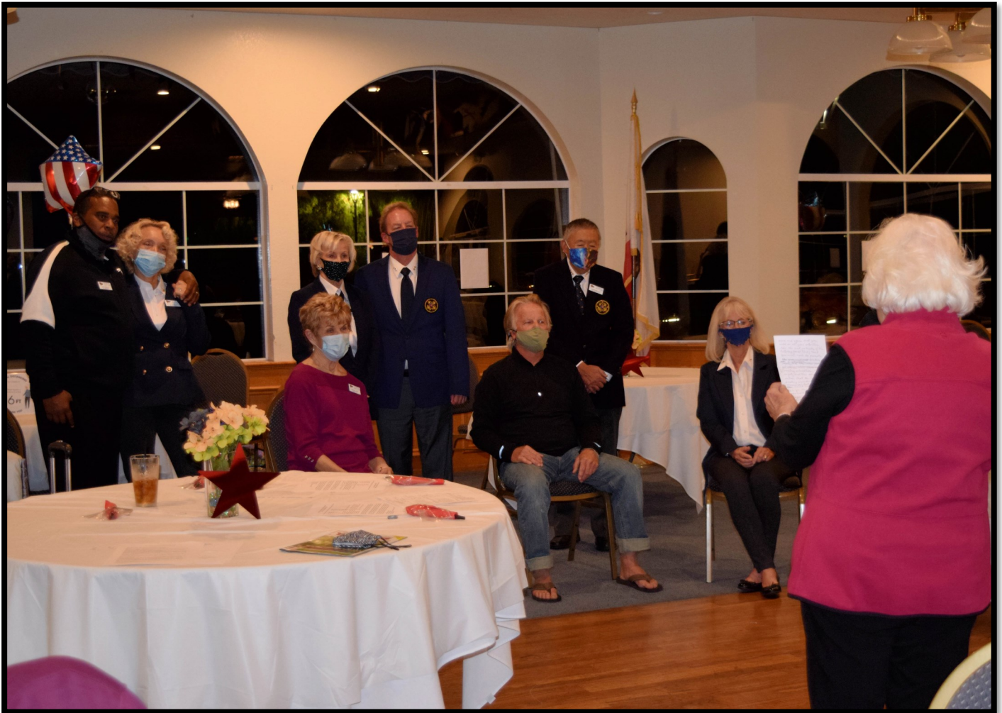
Swearing in the 2021 Board