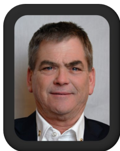
FLEET CAPTAIN fleetcaptain@pittsburgyc.com